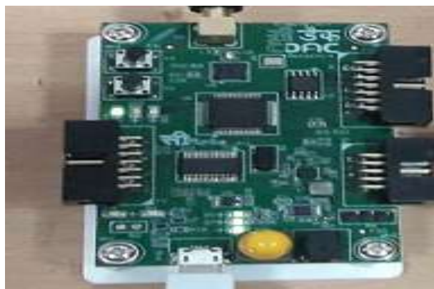
Figure 2:- C-mote board

C-mote can be used to setup and test different wireless sensor network applications. C-motes can be configured into different network device types like Coordinator, End Device, Router and can be used to test and develop different application and routing protocols. The Coordinator device acts as a data aggregator, the End Device acts as the data collector and the Router acts the range extender.